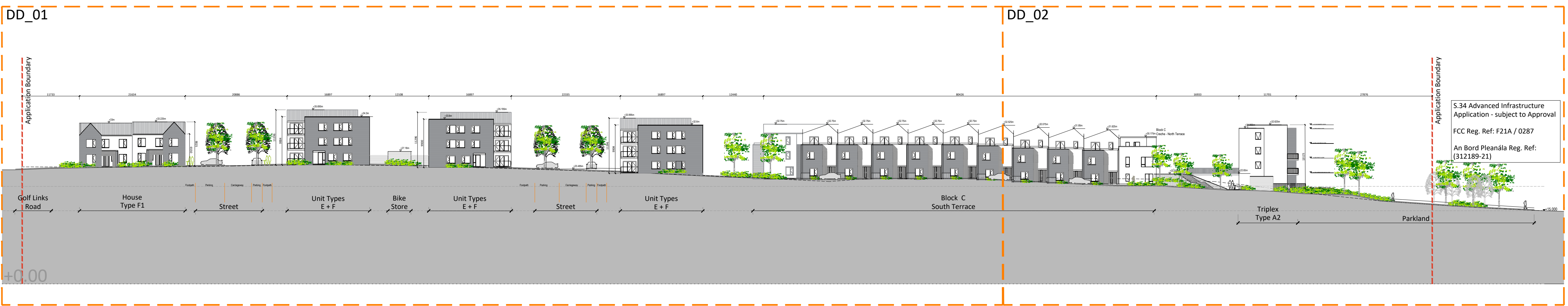
Section DD Esc 1:500