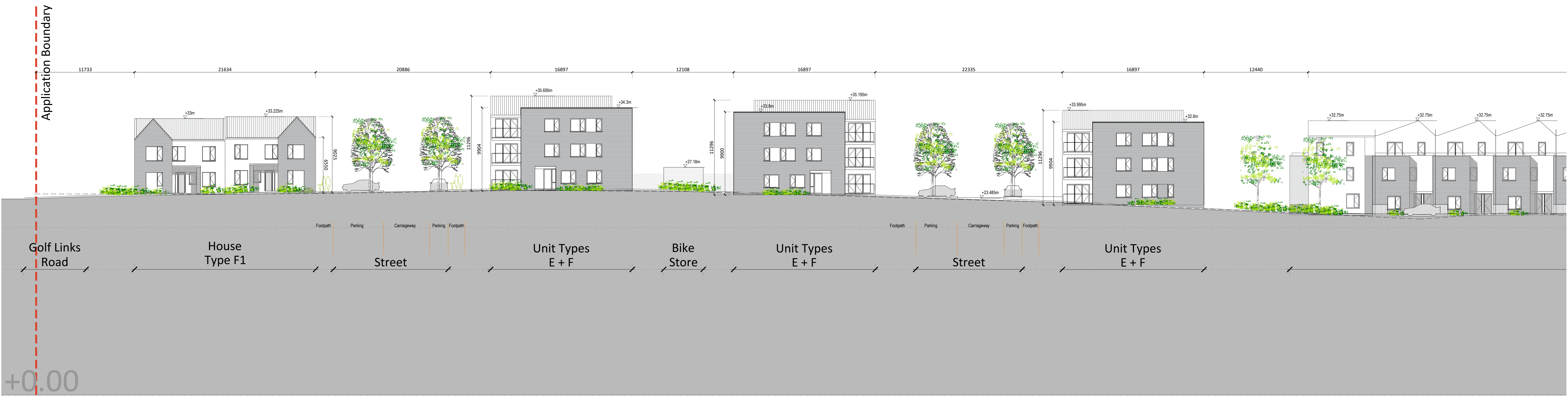
Section DD_01 Esc 1:200